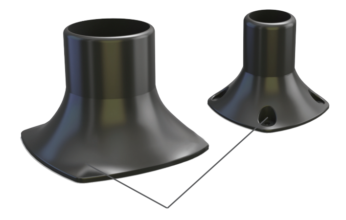
Designed with or without screw holes

For connection types not shown here, contact us.